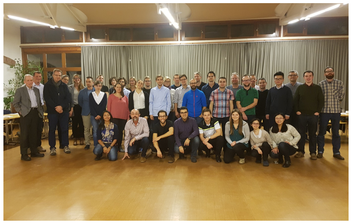
Fig. 3: The doctoral students of the Vienna Doctoral Programme on Water Resource Systems with their supervisors and the advisory board.