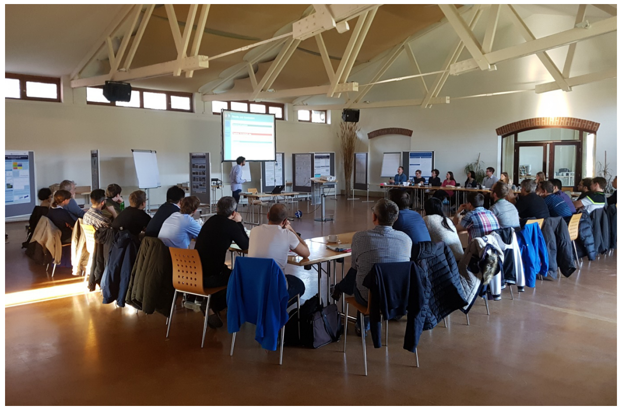
Fig. 1: The doctoral students gave oral presentations on their latest research.